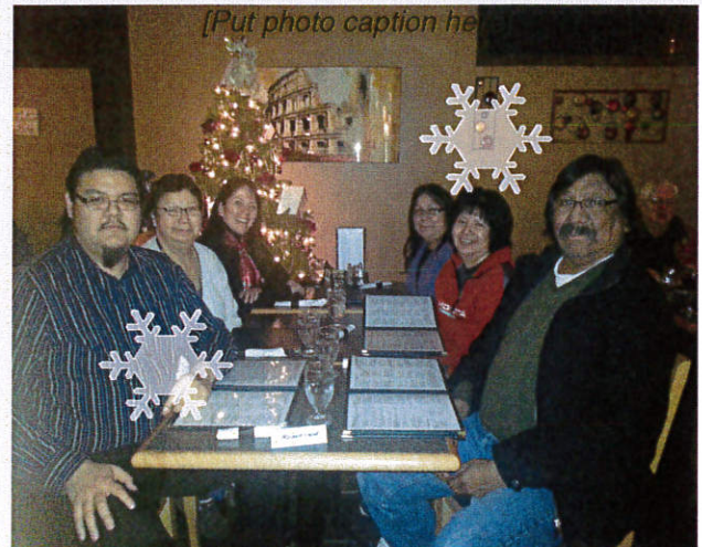
McDowell Lake First Nation Team